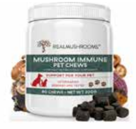
Mushroom Immune Pet Chews